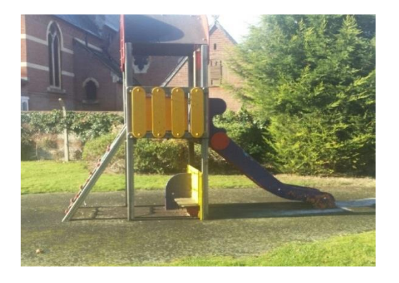
What do you think?