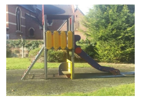
What do you think?